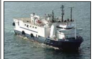
RV26660 Seismic Vessel