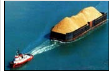
DB30013 Deck Barge