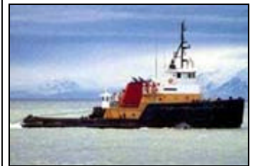
TG57004 Twin Screw Tug