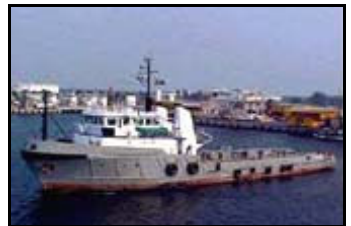
SU19541 Tug Supply Boat