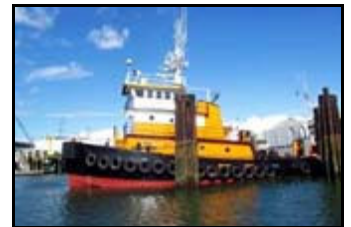
TG21084 Triple Screw Tug