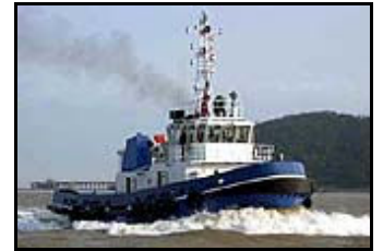
TG32095 Twin Screw Tug