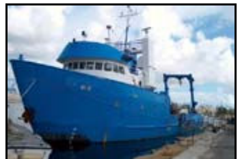
RV10600 Research Vessel