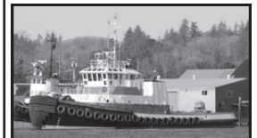
TG67112 Tug - Azimuthing