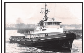
TG72112 Tug - Twin Screw