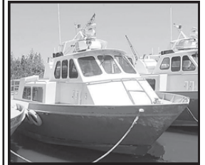
CB04211 Crew Boat