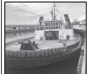
TG40077 Tug - Azimuthing