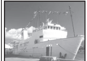
RV22338 Research Vessel