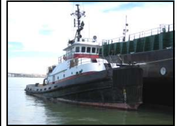
TG40124 Twin Screw Tug