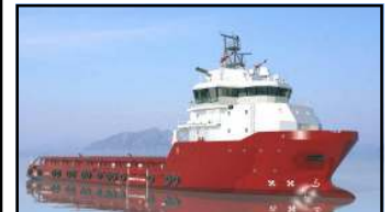
SU23650 Supply Boat